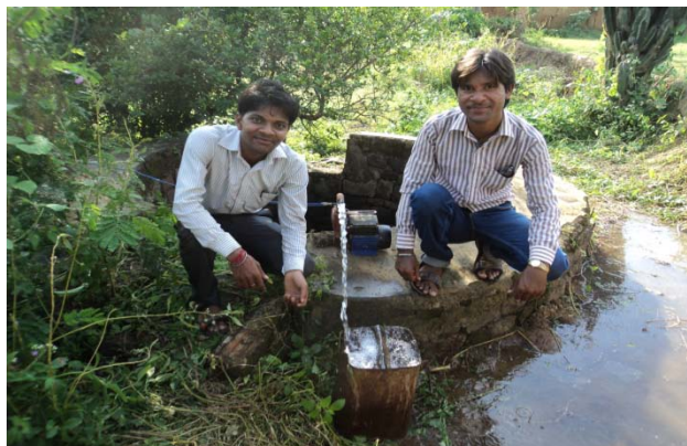
Fig. 4: The water pump powered by hybrid system to deliver water from the shallow well.