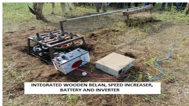
Fig. 1: Integreted Belan, Speed Icreaser, belt&pulley, alternator and battery.

(V) Storage system: In this experiment a typical 12V, 150AH Lead-acid automotive battery is used. An automotive battery is a type of rechargeable battery that supplies electric energy to an automobile. Charging time depends on the capacity of that battery and the resting voltage of that battery when you begin to charge it.