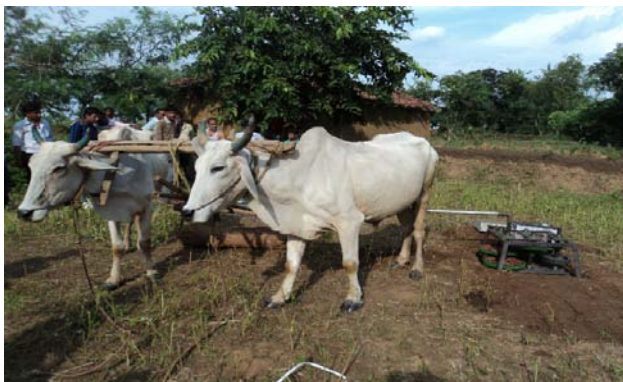
Fig. 2: Mechanical device for generating power using animal power.

Before starting the experiment the alternator was connected with battery and ampere meter was jointed in series. The mechanical link GI pipe was fitted with the first shaft of speed increaser by means of elbo and nut-bolt at one end and another end was coupled on belan with the help of GI wire such that the center of belan coincide at 2500mm of mechanical link. The speed increaser was fixed in the pit of 780\text{mm} \times 780\text{mm} \times 300\text{mm} . The bullock pair was harnessed with traditional means. The shepherded applied the force the bullocks started moving into the circular path and also the belan along with mechanical link rotate the first shaft of the speed increaser. At the starting the rpm was very low hence the alternator was not responding but as well as speed was increasing the alternator start to generating power. Bullocks were need to applied force time to time to maintain average speed. The rpm and generated volt & current were taken after every four minutes. The batteries were 50% charged and it took approximate 2 hours to charge fully (multimeter indicate 12.6V). In first two experiments the automotive battery of 12V 150AH was charged with animal power system and the 0.5 hp water pump run using inverter of 1000VA. The suction head was 4.7 meter and it took 28 second to deliver 15 litter water. Next two experiment the battery was charged with human power system and water pump run using same inverter.