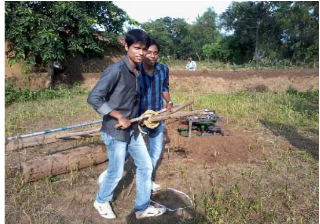
Fig. 3: Human powered mechanical device for generating power.

This time it took 26 second to deliver 15 litter water. Finally charged batteries by human power and animal power were connected to inverter in parallely and 0.5 hp water pump run very efficiently and deliver water continuously for long time and up to 75% discharge.